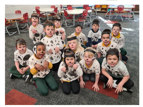
To celebrate our 101st day at school, the Turtles dressed up as 101 Dalmatians.

We did lots of activities around the number 101, including writing 101 words, using 101 cubes to make a long stick, doing 101 drawings and seeing what 101 counters looks like. It was a very busy, and fun day!