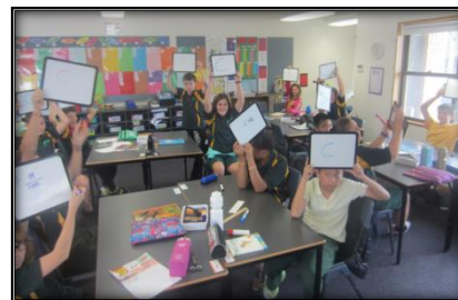
Students are engaged and participate with confidence

2. Teachers identify the needs of every student.