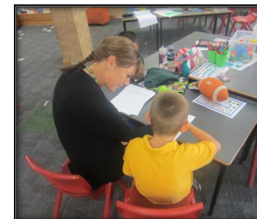
Individual feedback is focussed on the work

At Richardson Primary School we have a whole school approach to teaching and learning. We use these five principles to engage all students in every classroom.