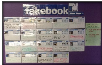
Students share their knowledge

1. Students can explain what they are learning and why.