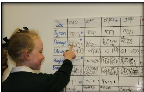
Students use work samples to select quality writing

2. Teachers identify the needs of every student.